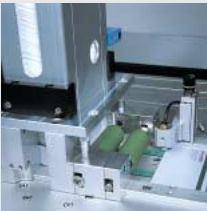
Standard magazine for up to 500 cards with a thickness of 0.8 mm, friction separation and double card detection sensor.

These great features combined with the printing and marking know-how of KBA-Metronic's specialists are your guarantee of flexibility, individuality and dynamic performance