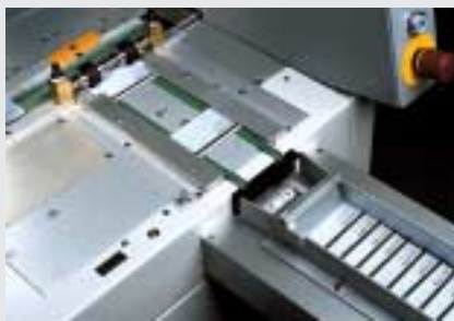
Delivery module with reject shunt

Despite its complexity, the Universys is very easy to operate. Operators use well-designed screen forms on the display to recall all of the job-specific parameters. The user is guided through