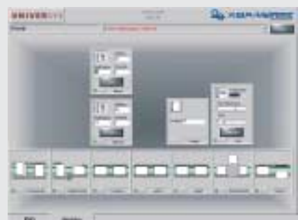
Operators control all Universys machine functions from a simple, user-friendly display.