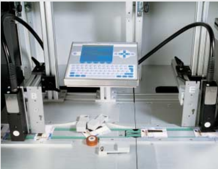
The rotation module rotates the cards to place them in landscape and portrait orientation, so that marking can be applied in both directions.

Users can have a choice of two magnetic stripe coders depending on the applications requirements: LOCO and HICO. The LOCO can write data to 14,000 cards per hour. The HICO model has a capacity of 6,000 cards per hour regardless of the data density on the cards. A read station verifies that the data has been transferred correctly to the card. These units address the growing need for magnetic stripe cards including customer cards, gift cards and membership cards.