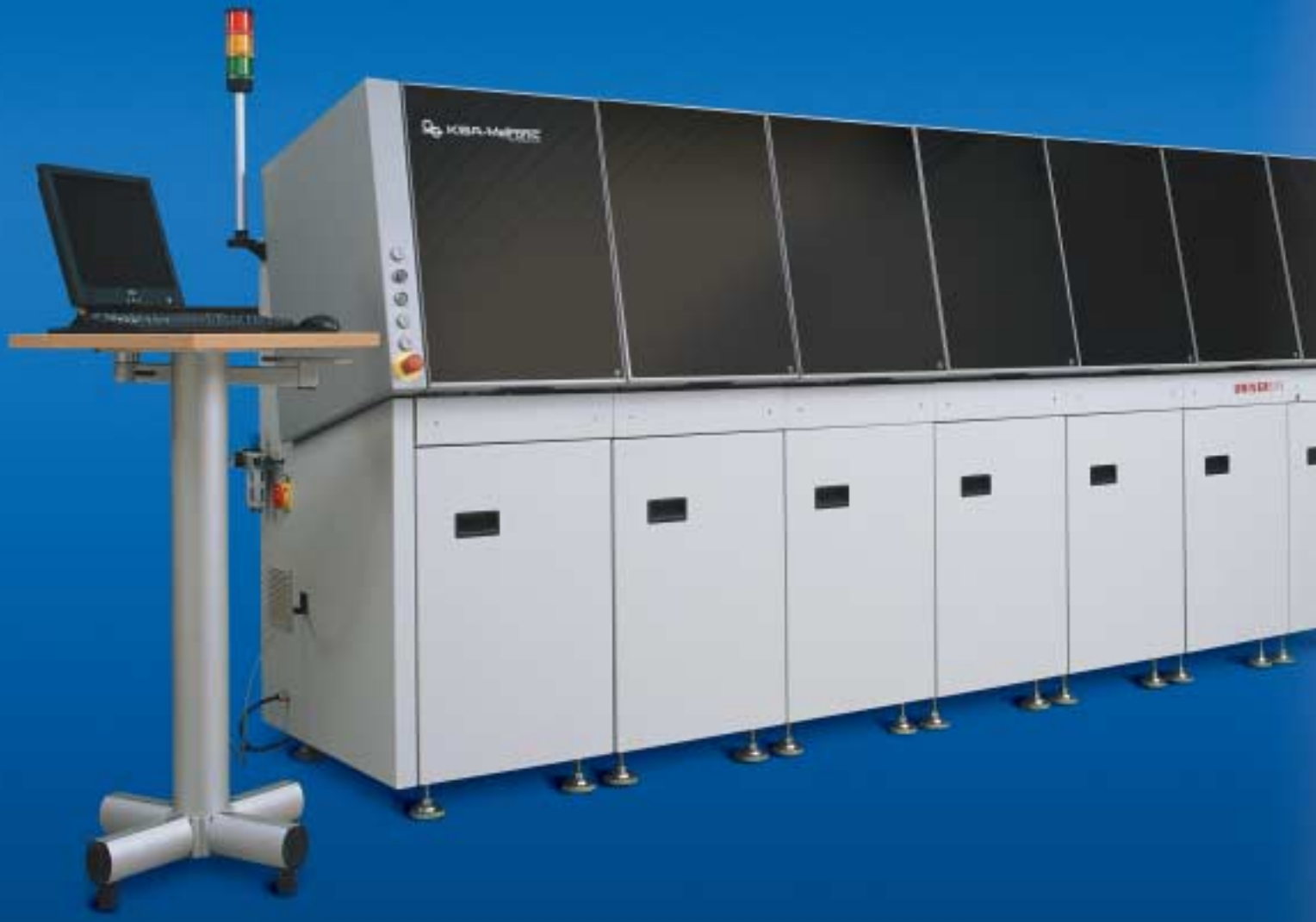
Universys with seven modules ready for operation

Despite its complexity, the Universys is very easy to operate. Operators use well-designed screen forms on the display to recall all of the job-specific parameters. The user is guided through